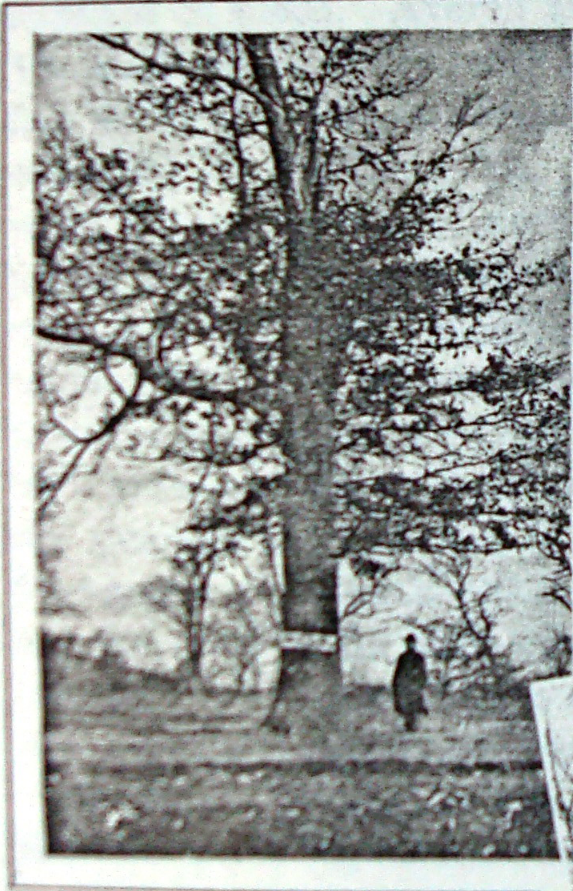
TREE UNDER WHICH GEN. ROBT. E. LEE SLEPT, NIGHT OF SEPT. 15, 1861. NEAR DROOP MOUNTAIN.